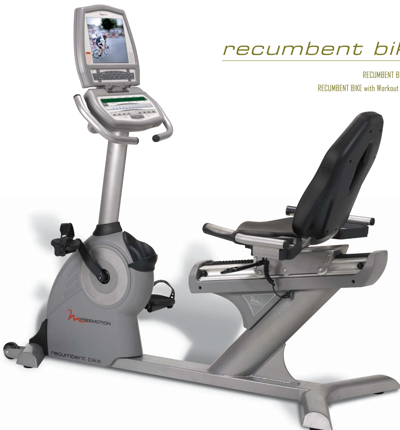
Recumbent Bike shown with Workout TV console - FMEX2506P

RECUMBENT BIKE with Workout TV - FMEX2506P