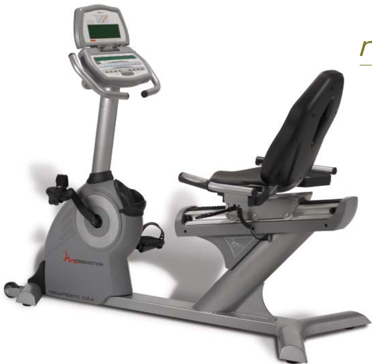
Recumbent Bike shown with basic console - FMEX2256P